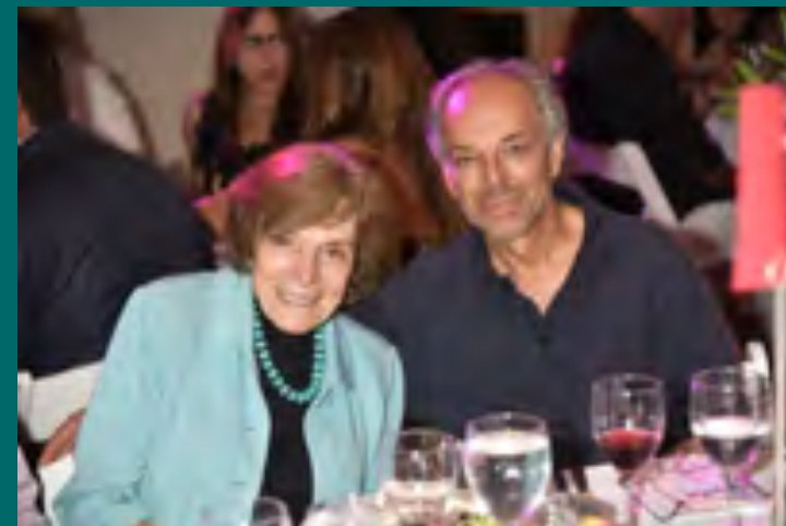
Dr. Sylvia Earle with Honoree Dr. Carl Safina.