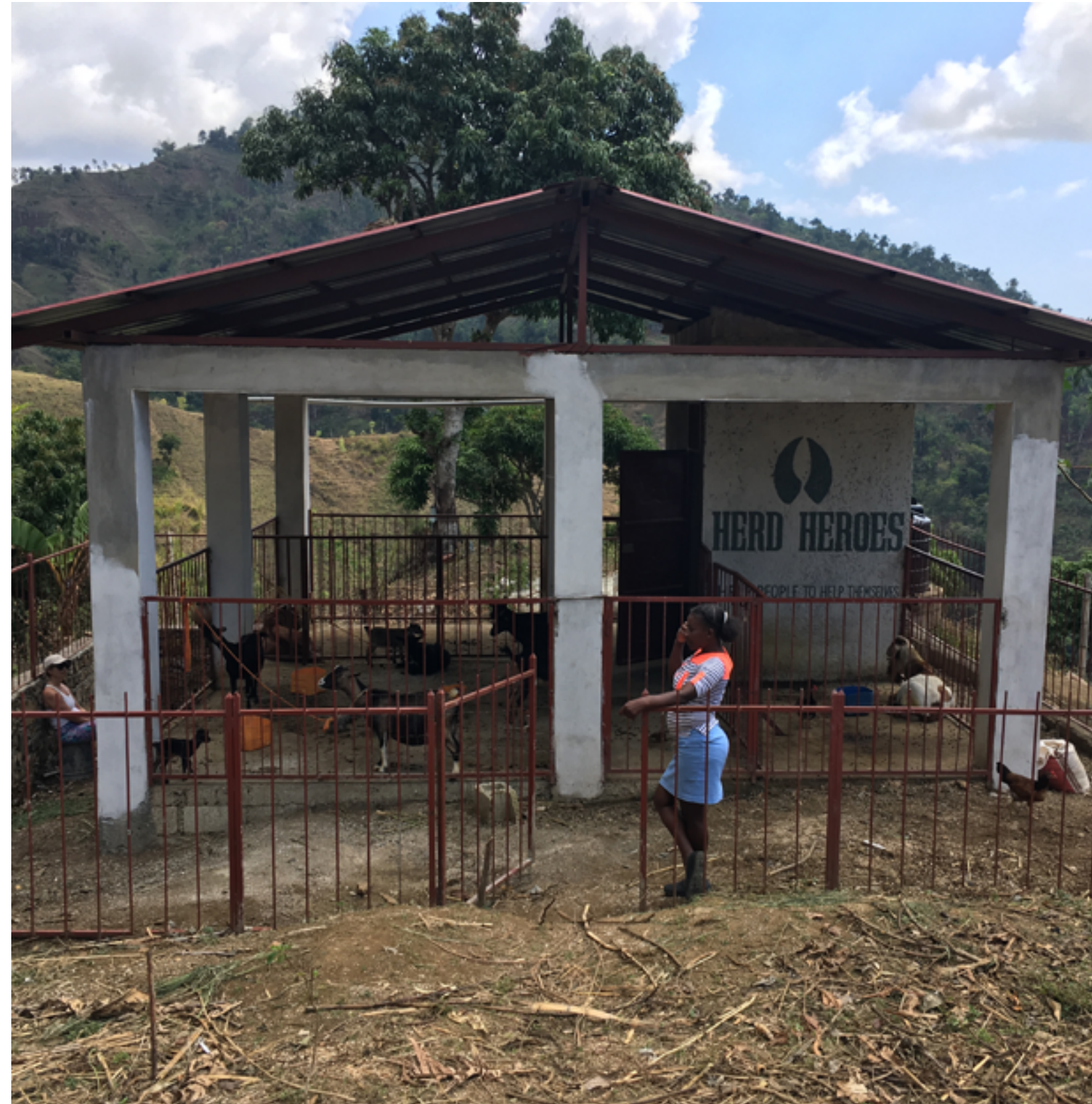
Herd Heroes Field Station Constructed in 2018

VI is funding the training of female Community Agricultural Health Workers (CAHW) at the L'Azile station. These CAHWs specialize in treating animals for injuries and preventable diseases, and help manage a sustainable, intensive breeding management program. Additionally, and more importantly, each CAHW trainee serves as a role model and mentor to other young women in the community.