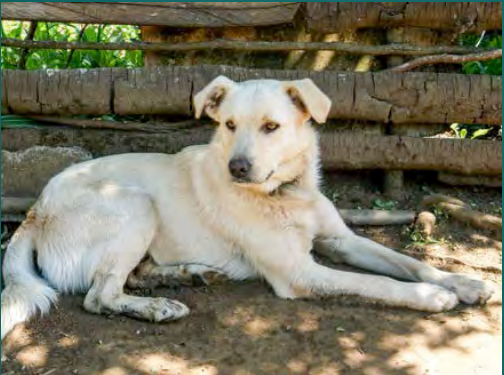
One of the winning entries.

In a small rural village called Punucapa, the GAAP invited 10 children to participate in a workshop to learn about photography, and asked them to tell a story about their lives with animals through the photographs that they produced over the five weeks of classes. The children presented their best shots at a local exposition and we will also present their work at our November dog-themed fundraiser in New York City in 2016. Fuji generously donated 5 cameras to us, which we sent to Chile.