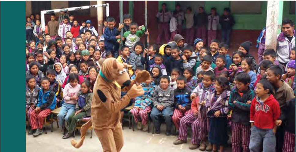
Kids getting excited for their lesson on humane treatment and behavior towards dogs.

Vaccinated 350 dogs against distemper virus