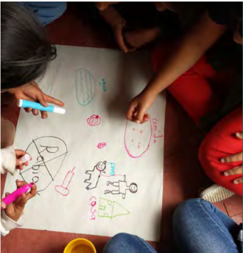
Kids illustrating what responsible dog ownership means to them.